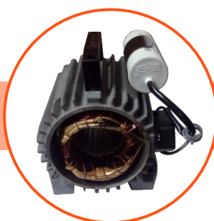
CI FG - 260 Grade